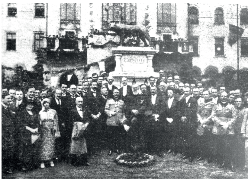
Inauguration ceremony of the “monument of Latinity” (replica of the Capitoline Wolf statue in Rome) in Târgu Mureș (Marosvásárhely), 1924.