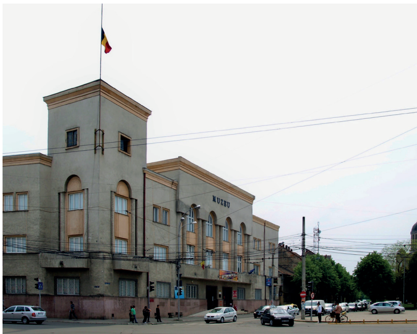
The building of the prefect's office in Satu Mare (Szatmárnémeti) completed in 1936. Today it hosts the County Museum of Satu Mare. In the background we see the Orthodox Cathedral built in 1937-1938.