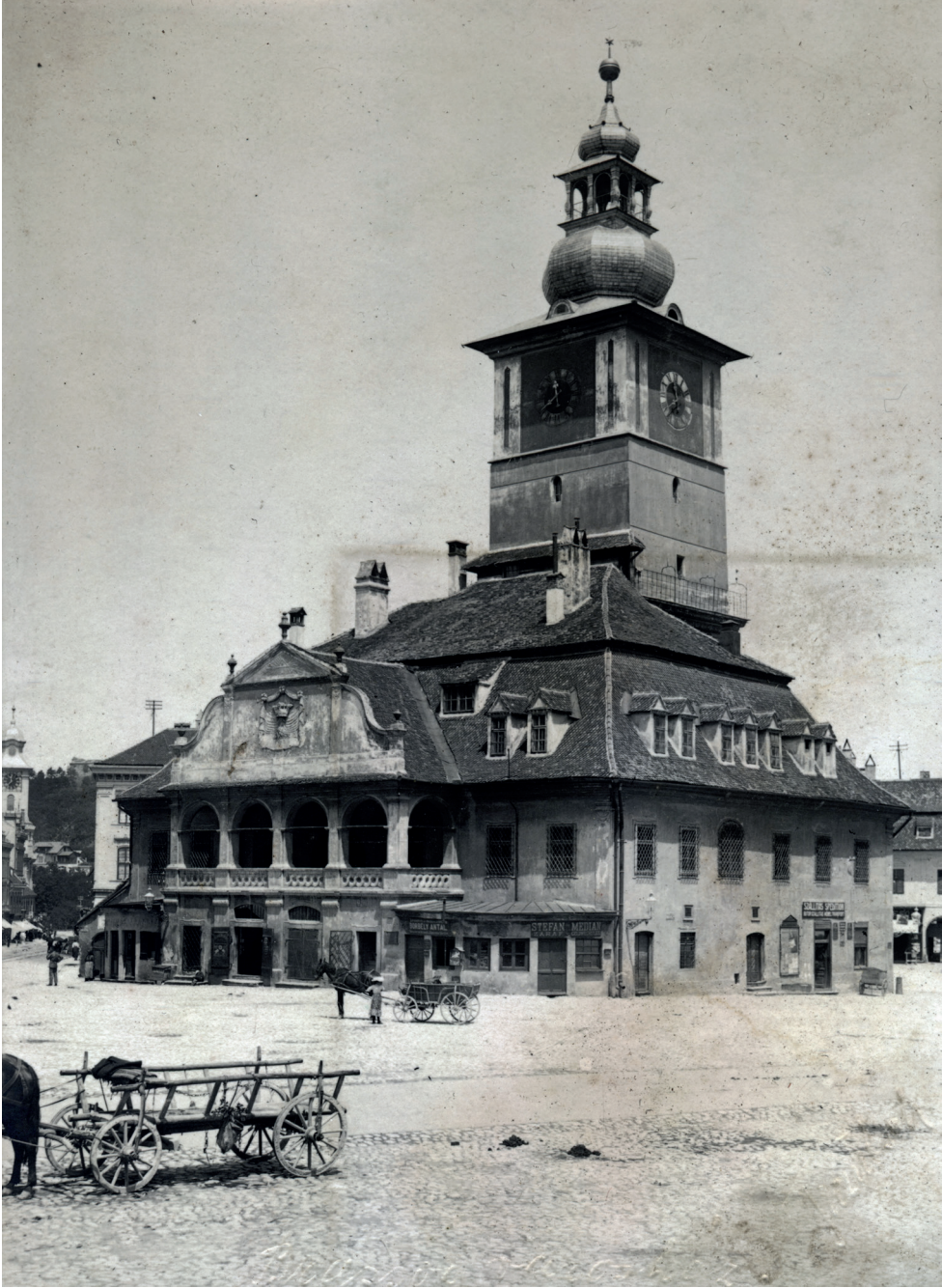
The old City Hall in the main square of Braşov (Brassó, Kronstadt) in 1920.