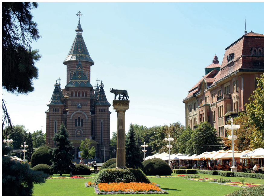
The centre of Timișoara (Temesvár, Temeswar) with the Orthodox Cathedral (from the second half of the 1930s) and the replica of the Capitoline Wolf statue.

that the supremacy of Hungarians and the civilizing role of the Hungarian state should be used as arguments for keeping the territorial integrity of Hungary. 4 Hence, the fact that Romania received the sanction of the powers for occupying Transylvania and the Hungarian sense of mission triggered cognitive dissonance between the image of Romanians and the Hungarian sense of mission. This led to a discourse which centred on the paradox between the position for which Hungarians should be “entitled to” and the actual situation. The contradiction between the actual position and the “rightful place” of Hungarians in Transylvania became one of the key elements of the new discourse on Transylvania that emerged in the Hungarian public sphere and that flourished in the interwar period. Topoi that we would call elements of identity politics today, emphasizing that in a minority position all-national solidarity and holding on to the Hungarian national belonging were essential, were also important. Since this discourse, implicitly or explicitly, saw the remedy in revising the Trianon Treaty, it suited the context of contemporary revisionism.