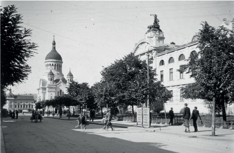
Street view from Cluj (Koložsvár) with the Orthodox Cathedral constructed during the 1920s and 1930s and the National Theatre. Source: Fortepan/László Lajtai, 1934.

In the sections that follow, I will make an attempt to grasp how the works mentioned above presented the current status of towns in Transylvania and how they enriched the Hungarian discourse on Transylvania, especially the narrative about the alleged civilizing role of Hungarians. Among the many possible lines of inquiry, I will focus on how they assessed the changes, what they believed social transformation entailed, how they thought of modernity and how they represented the West-East slope.