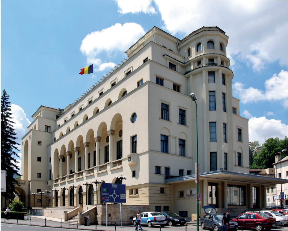
The building of the Cercul Militar (Club of Army Officers) in Braşov constructed cc. 1930s and 1940s.