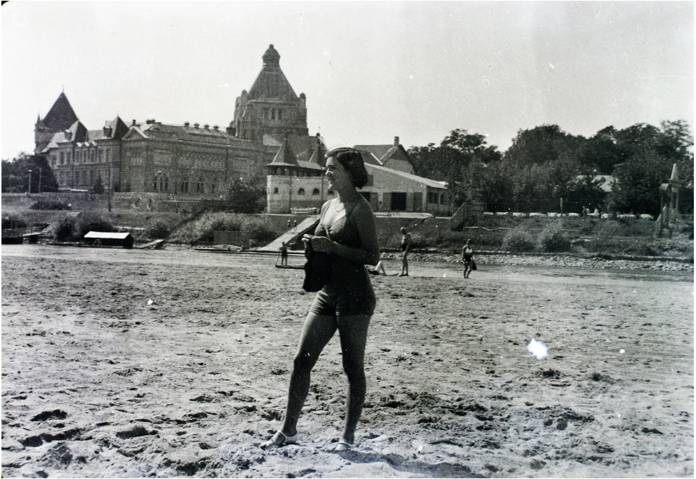
The banks of River Mureș in Arad (Arad) with the Palace of Culture and the rowing club in the background.

The author expresses his optimism, too: “ It is the calling of Arad the set the standards for understanding among nationalities. ” 54